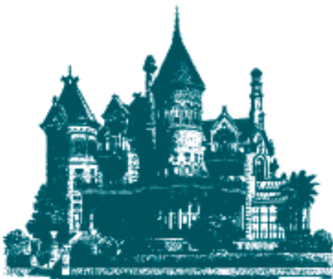
Walter Gresham Home – Bishop's Palace, 1402 Broadway

Property owners enjoy the services and social contact of the East End Historical District Association (EEHDA), an association of neighborhood residents dedicated to preserving the area and maintaining a high quality of livability. Besides encouraging residential cooperation with the City of Galveston's Landmark Commission, EEHDA holds block parties, and a Christmas Homes Tour. The association has an active membership which has developed park areas (including the Darragh and Alderdice Parks), renovated a community center for residents' use and works with the City to protect this area.