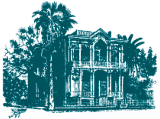
Lemuel Burr House, 1228 Sealy

102. 511 17th Street, Isaac Heffron Home, 1899. Prominent cement contractor Isaac Heffron had Charles W. Bulger design the red brick house reminiscent of an Italian villa. Surrounding the grounds are the original walls and gates.