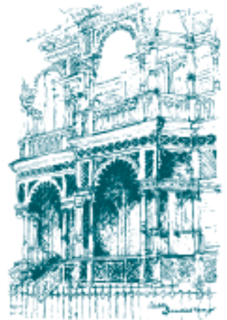
Sonnentheil House, 1826 Sealy