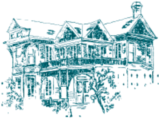
Fredrick Beissner House, 1702 Ball

105. 1527 Postoffice, Ernest Stavenhagen Home, 1913.