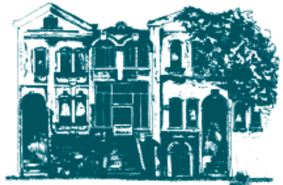
Lucas Apartments, 1407 Broadway

34. 1412 Sealy, August J. Henck Cottage, c. 1893. Notable features in this ornate Victorian cottage are the stained glass windows on the bay window.