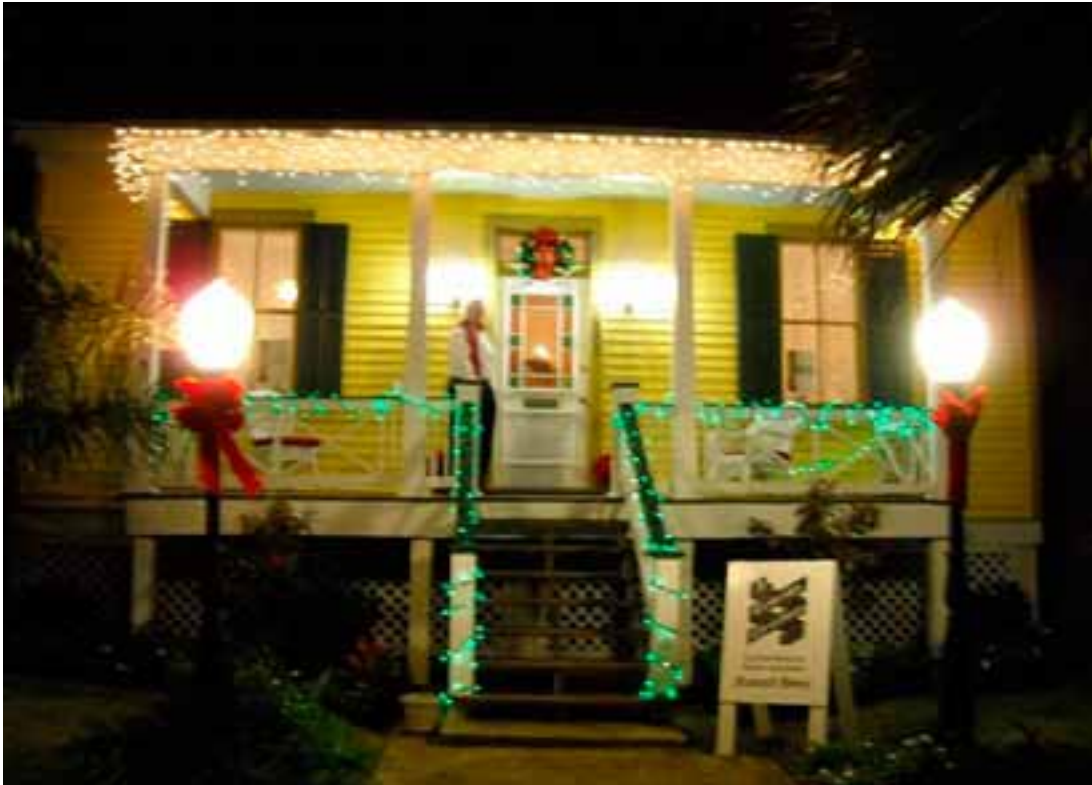
The Cottage lit up the night for 2012 EEHDA Christmas Homes Tour.