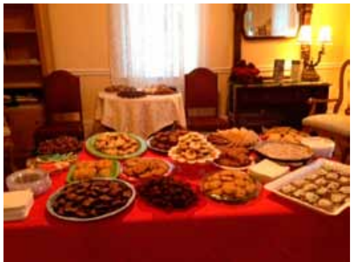
Volunteers prepared an array of holiday treats for Homes Tour visitors to The Cottage.